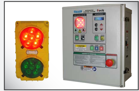
UniChock includes light communication and can be integrated with other dock equipment.