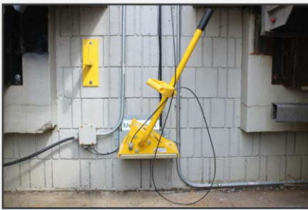
Easily stored and away from damage or debris.