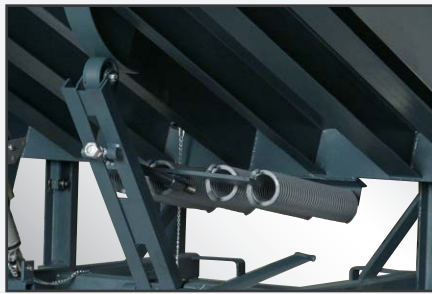
One point adjustable main spring assembly with roller and cam construction.