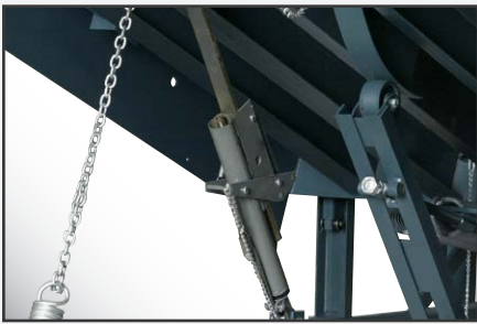
Unique hold-down assembly allows for full float and automatic release capability with air ride trailers.